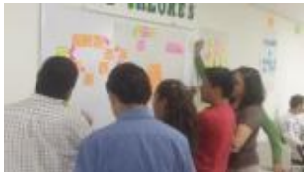
LAC participants interact with content